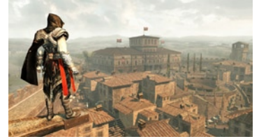
Assassin's Creed II . Image courtesy of Ubisoft.

Incorporating a wide array of tools that help accelerate everyday workflows, Autodesk® 3ds Max® software helps significantly increase productivity for both individuals and collaborating teams working on games, visual effects, and television productions. 3ds Max provides a comprehensive solution for modeling, animation, rendering, and effects, together with the powerful 3ds Max Composite high dynamic range (HDR) compositing system. Artists can focus on creativity, and have greater freedom to iteratively refine their work to help maximize the quality of their final output in the least amount of time.