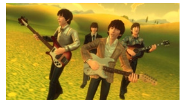
©2009, The Beatles: Rock Band .

3ds Max, well known for its extensive polygon modeling and texturing toolset helps you to get the job done faster. The Graphite toolset incorporates 3D modeling tools for freeform sculpting, texture painting, and advanced polygonal modeling —unified in a highly efficient user interface. Moreover, extensive UVW mapping tools help facilitate a wide range of operations for creative texture, planar, and pelt mapping, and enable direct manipulation of texture mapping coordinates.