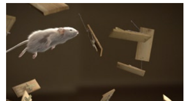
Kerry LowLow 'Mouse', Fallon, Image courtesy of MPC.

Through a combination of multi-threading, algorithmic tuning, sophisticated memory management, and tools for segmenting scenes, together with 64-bit offerings for Windows®, Linux®, and Mac OS® X operating systems, Maya is engineered to more elegantly handle today's increasingly complex data sets without slowing down the creative process.