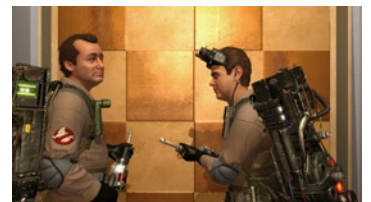
Ghostbusters™: The Video Game.

Increased competition and tighter deadlines, combined with higher audience expectations for quality, mean that many productions require artists to produce more creative output in less time than ever before. Maya helps maximize productivity with optimized workflows for everyday tasks, opportunities for collaborative, parallel workflows and re-use of assets, and automation through scripting for repetitive tasks.