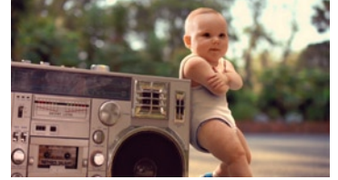
Evian 'Skating Babies,' BETC Euro RSCG.

Help modernize your pipeline from end-to-end, with Autodesk Maya: a state-of-the-art creative solution for 3D modeling, animation, simulation, effects, rendering, matchmoving, and compositing in a single affordable offering. Incorporating innovative dynamic toolsets for cloth, hair, fur, fluids, and particles; the powerful Maya Composite high dynamic range (HDR) compositing system; the Autodesk® MatchMover™ camera tracker; five mental ray® for Maya batch* rendering nodes; and the Autodesk® Backburner™ network render queue manager, Maya offers tremendous value. Maya software's award-winning technology helps artists, designers, and 3D enthusiasts around the world create more engaging and compelling digital imagery, stylistic designs, believable animated characters, and extraordinary visual effects.