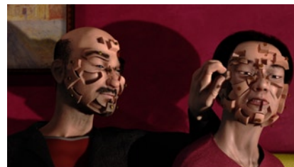
The Spine.

When a production requires more than an out-of-the-box solution, Autodesk's custom development center is standing by with a range of offerings, including custom code development, on-demand bug-fixing (even on prior versions) and a Production Assurance menu of services that will allow customers to get precisely the help they need, when they need it most.