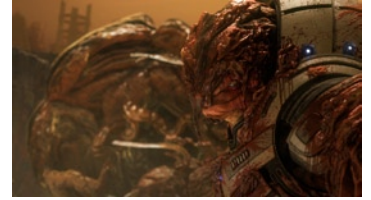
Mass Effect 2.

1 A Powerful Companion to Maya An ideal companion to Autodesk® Maya® software, Autodesk® Softimage® software is a high-performance, comprehensive 3D application that enables artists to use intuitive, nondestructive workflows to help create sophisticated character animation and effects. Featuring a unique, multi-threaded Softimage GigaCore architecture, and innovative tools: Interactive Creative Environment (ICE) and Softimage® Face Robot® toolset, Softimage helps extend a Maya pipeline with the ability to more quickly and easily create massively detailed simulated effects, advanced character rigs, and lip-synced facial setups.