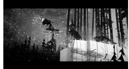
Studio AKA, image courtesy of BBC Winter Olympics.

Softimage offers extensive nonlinear animation capabilities: an interactive timeline for animation editing and playback, and a powerful animation mixer to help create complex animations more quickly and easily. You can mix and layer animation clips, composite clips, constraints, and expressions to shapes and textures, as well as create libraries of animations. The mixer helps give you high-level control with low-level precision for increased quality and productivity.